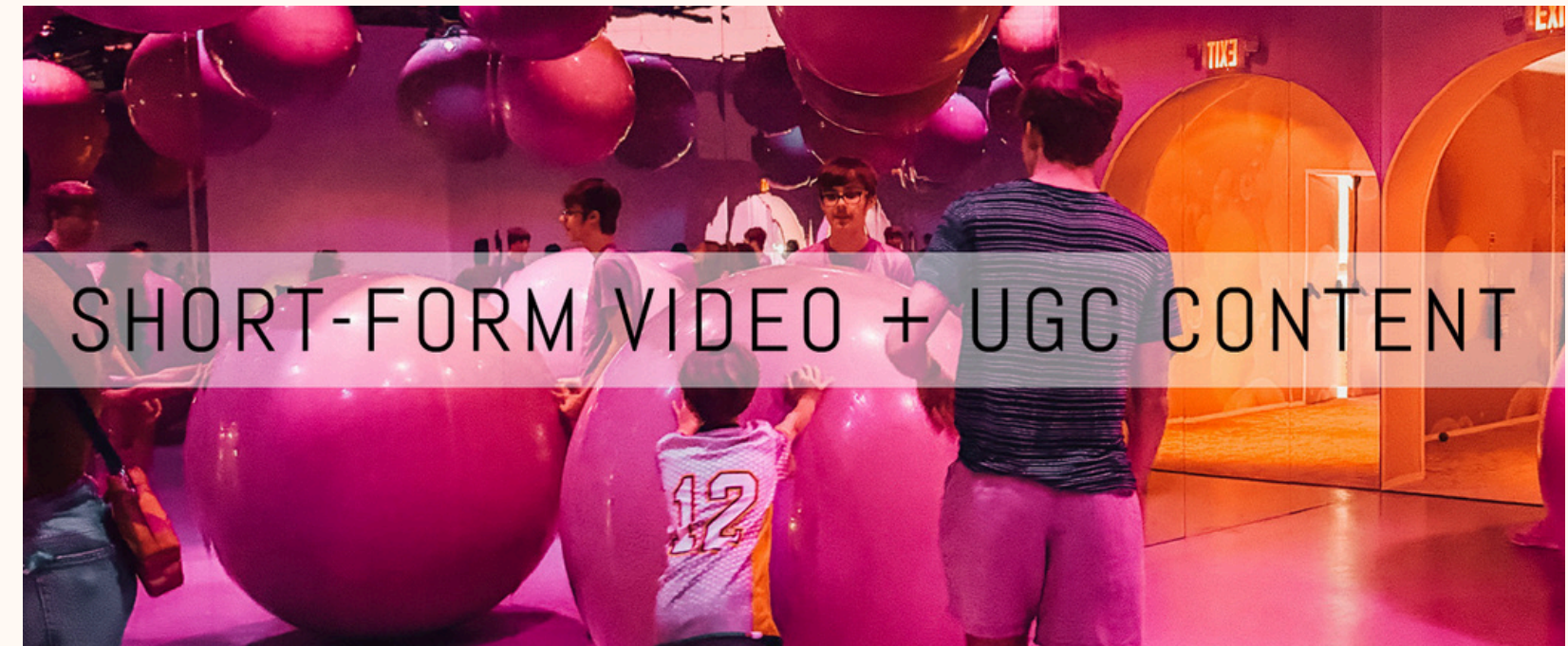
TikTok + social-first storytelling