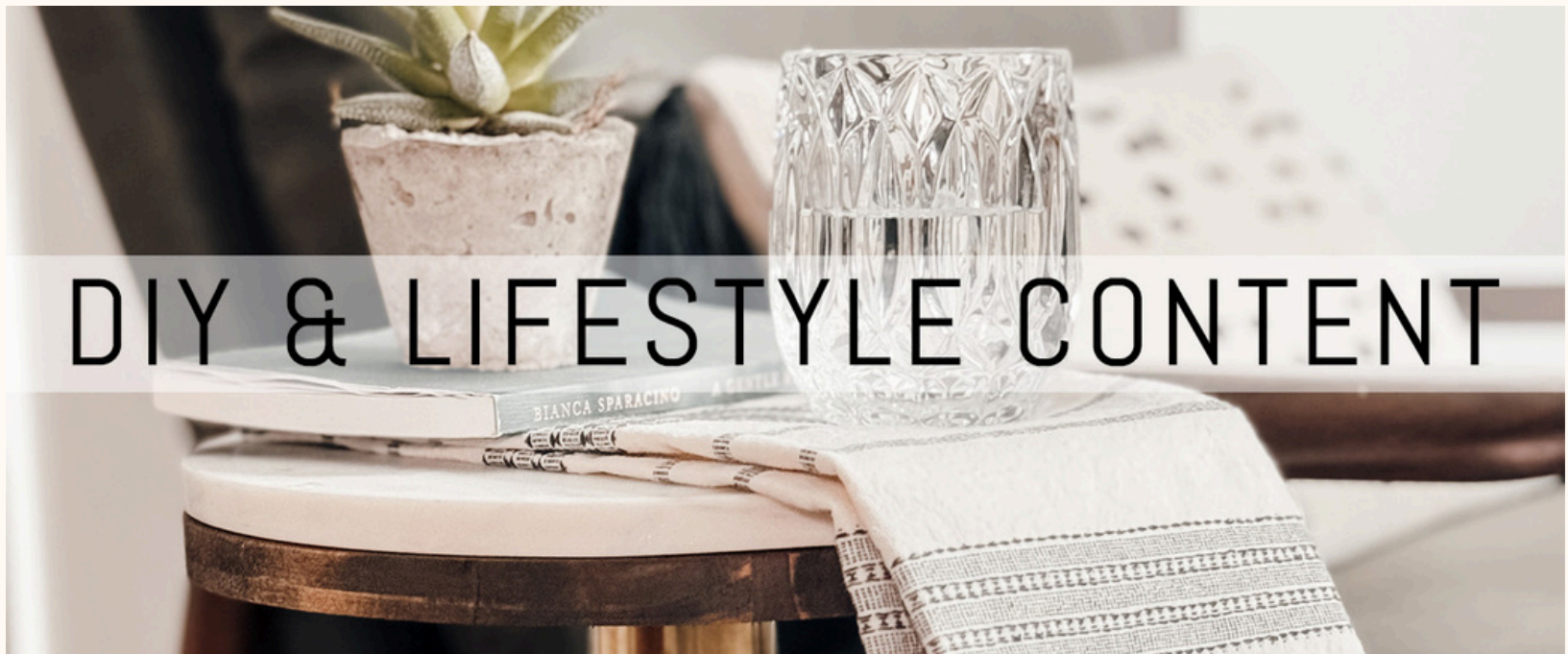
Building, creating, and storytelling through hands-on content